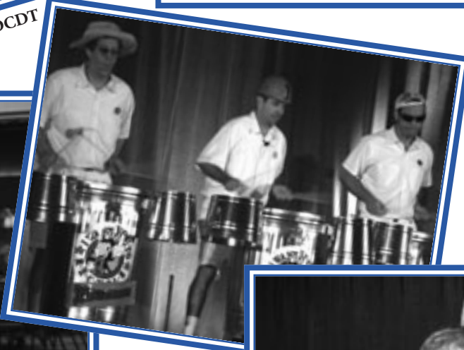
Opening conference drums