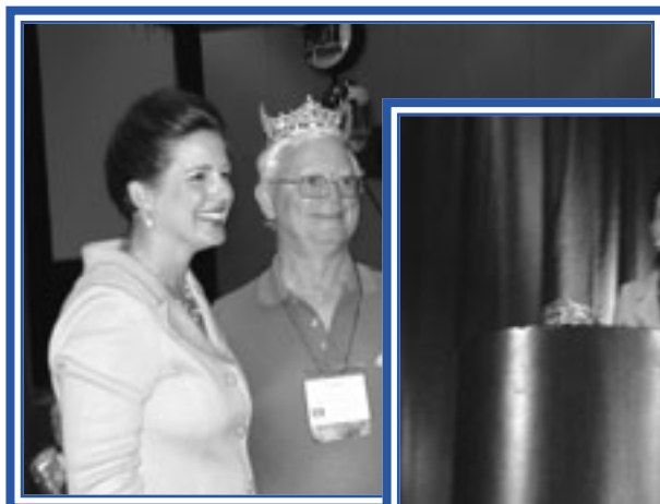
Wearing the crown