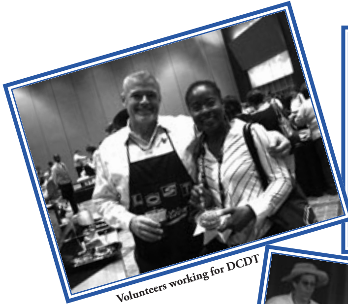
Volunteers working for DCDT