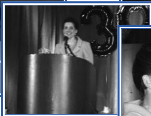
Miss America speaks on overcoming disabilities